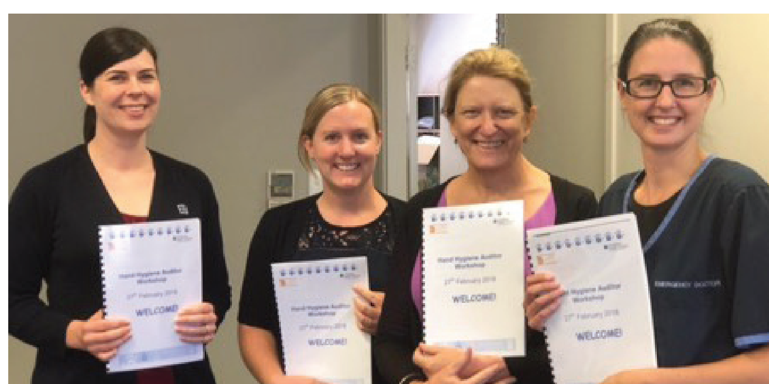
HHCS: From Allied Health, IPC, Nursing Executive, Medical Practitioner