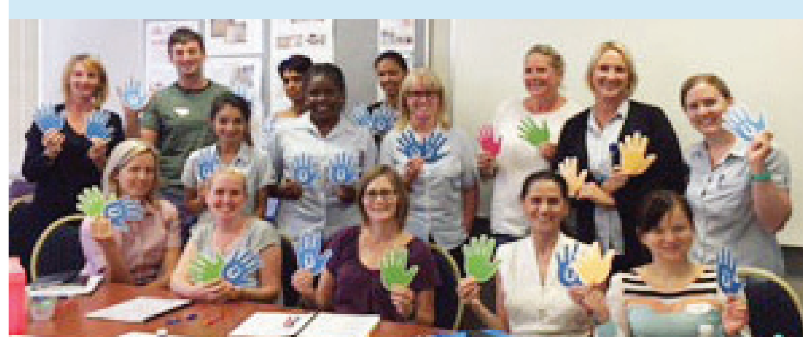
Site based HH Training Day